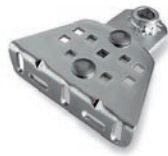
PLA15 screw-adjustable front bracket