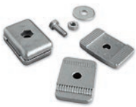
PLA13 travel stops for closing and opening manoeuvres