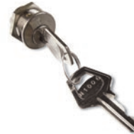
CM-B lock with two metal keys compatible with SELE