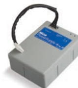
PS124 24V battery with built-in battery charger