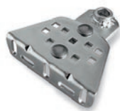
PLA15 screw-adjustable front bracket