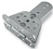
PLA14 screw-adjustable rear bracket