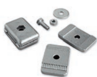
PLA13 travel stops for closing and opening manoeuvres