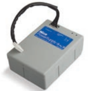
PS124 24V battery with built-in battery charger