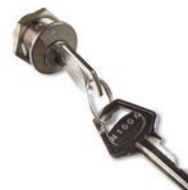
CM-B lock with two metal keys compatible with SELE