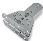
PLA14 screw-adjustable rear bracket