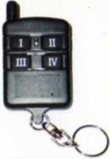
Programmable Remote Controls

Whether you in the car, walking the dog, doing the gardening or setting inside your home, you simply press the remote control button and your gate will open and if you like you can have a courtesy light come on while the gate is operating, using the same remote you can also operate your garage door or other devices (Extra receivers available).