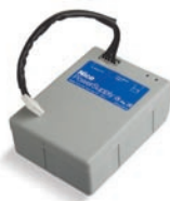
PS124 24V battery with built-in battery charger Pc/Pack. 1