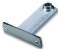
PLA8 screw-adjustable front bracket Pc/Pack. 1