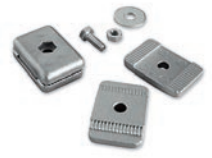
PLA13 travel stops for closing and opening manoeuvres Pc/Pack. 4