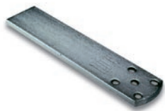
PLA6 rear bracket 250 mm long Pc/Pack. 1