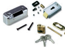
PLA11 horizontal 12 V electric lock (required for gates longer than 3 m) Pc/Pack. 1