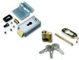
PLA10 vertical 12 V electric lock (required for gates longer than 3 m) Pc/Pack. 1