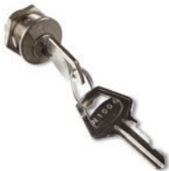
CM-B lock with two metal keys compatible with SELE